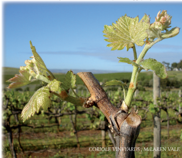
CORIOLE VINEYARDS, McLAREN VALE

Traditionalists will be pleased to hear that we are planting a new bush-vine Grenache vineyard. Here is a challenge for our viticulturist; to rediscover the planting techniques of a previous generation. The clones sourced were selected from old Barossa vineyards.