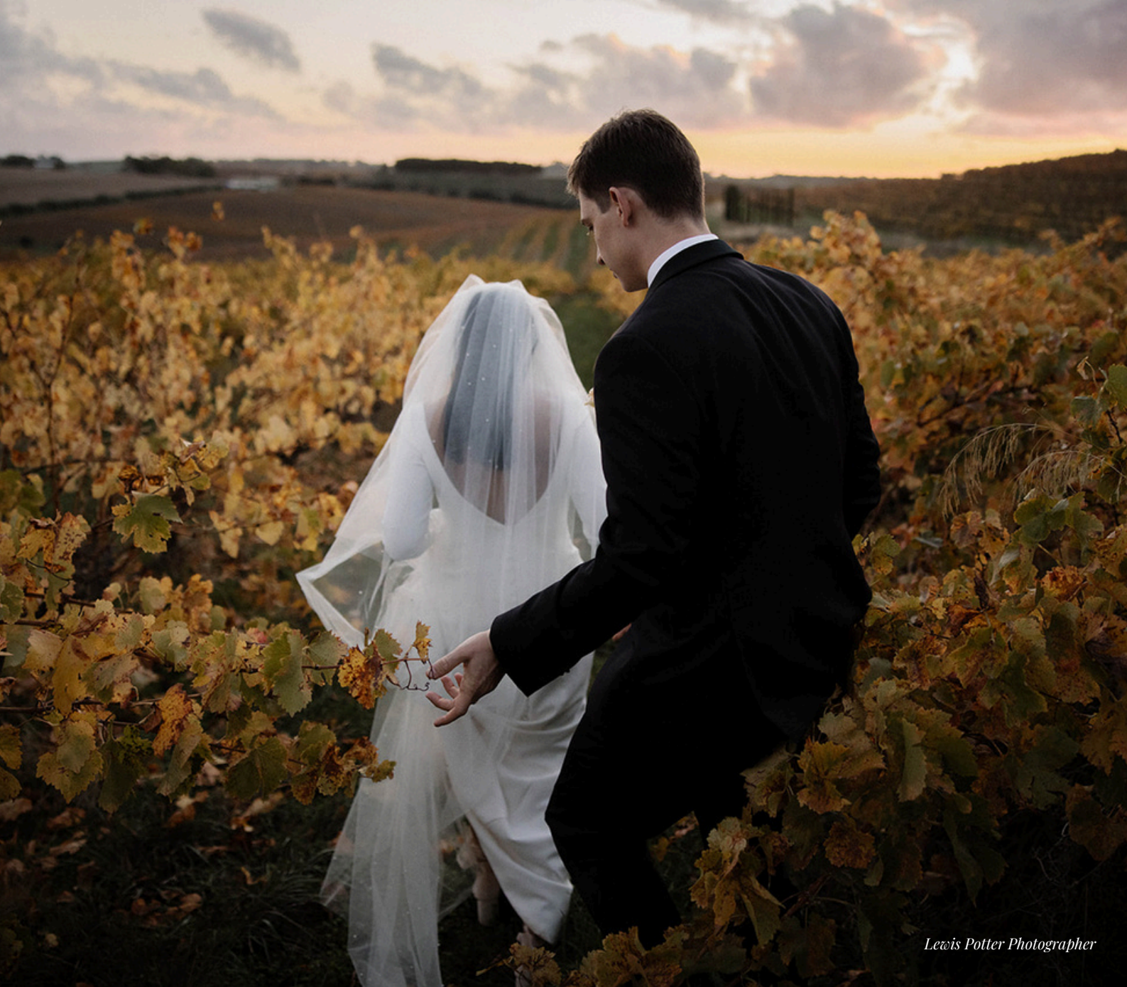
Lewis Potter Photographer