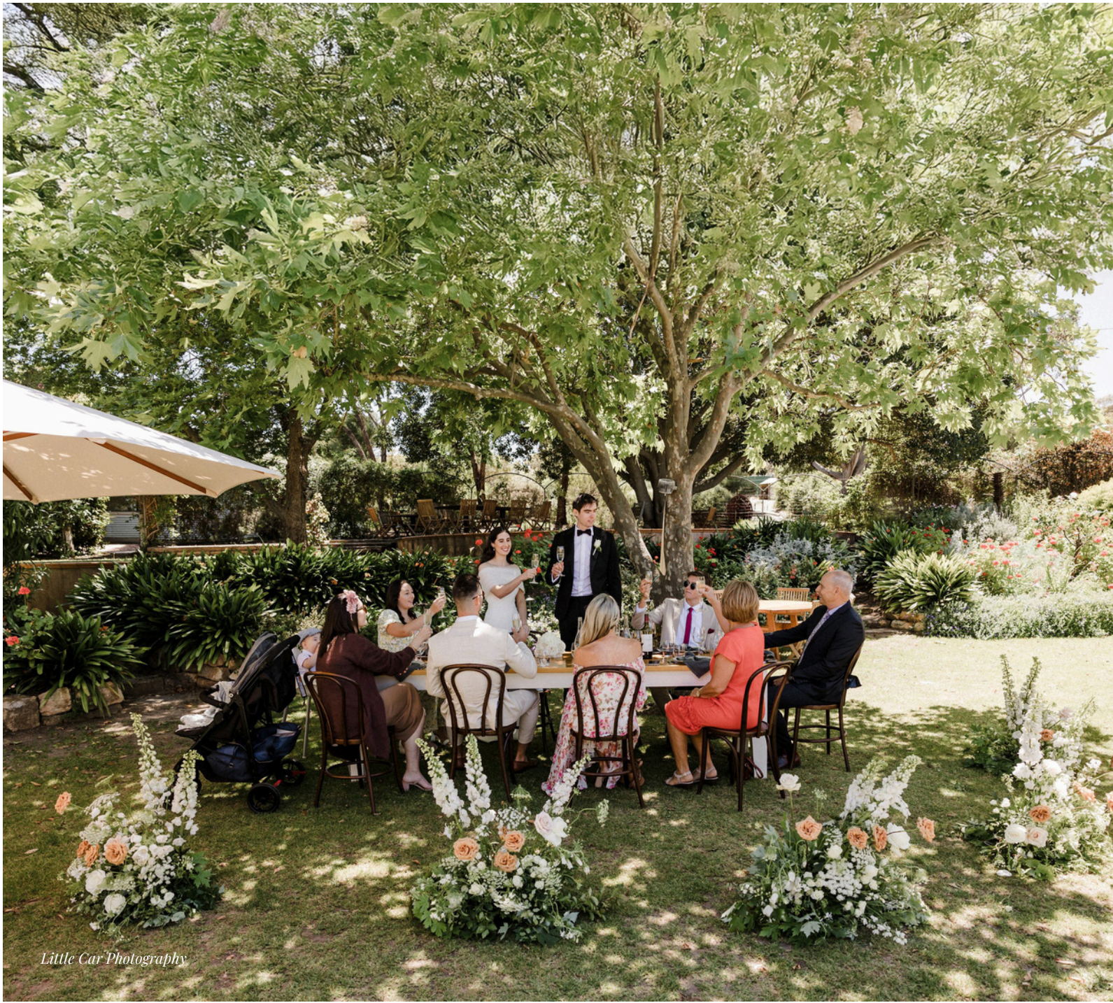
Little Car Photography