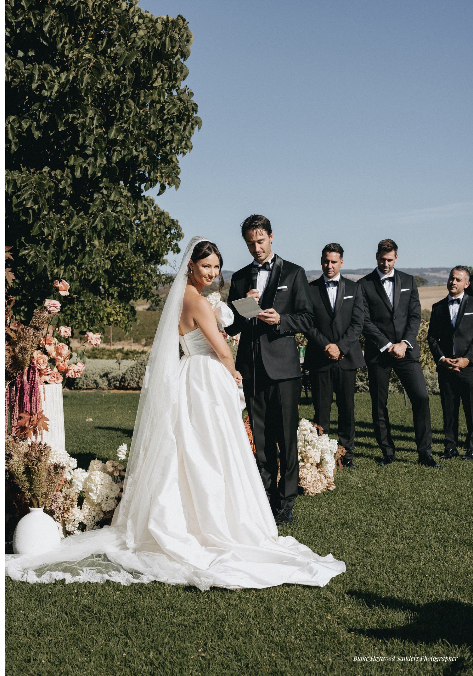
Blake Heywood Sanders Photographer

Courtyard seats 90 including dance floor space Stand up accommodates approximately 120