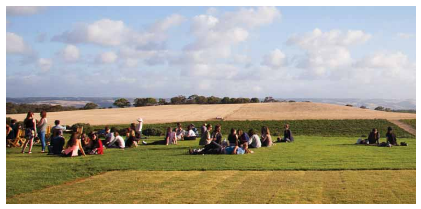
04 New lawns at Coriole. Croquet anyone?